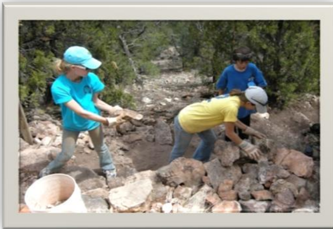
Rock Climbing/Camping Trip

Students may also participate in out of state trips during the spring intersession. These trips currently include Washing DC/New York City for 8 th graders and Seacamp Science Camp in San Diego, California. Sixth graders may participate in our Keystone Science Camp in Keystone, Colorado.